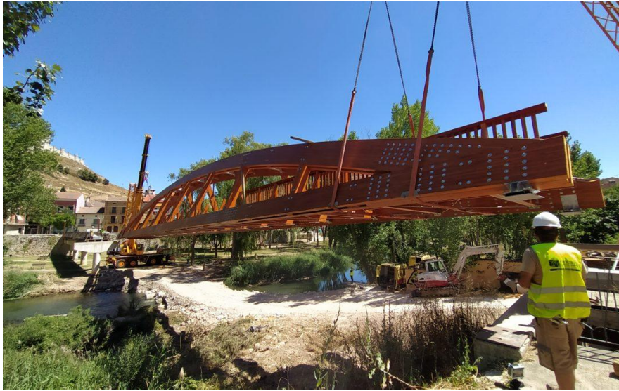
Figure 16: Puente Peñafiel (Valladolid) - (Montaje del Puente de Peñafiel, 2022)

The Peñafiel Bridge is a pedestrian timber bridge, with a total length of 50 meters and a useful width of 2 meters, featuring a dual-level arch support structure. The two lateral glulam arches are inclined towards the structural centroid to enhance stability; however, these two planes do not directly connect and are instead linked by horizontal timber elements.