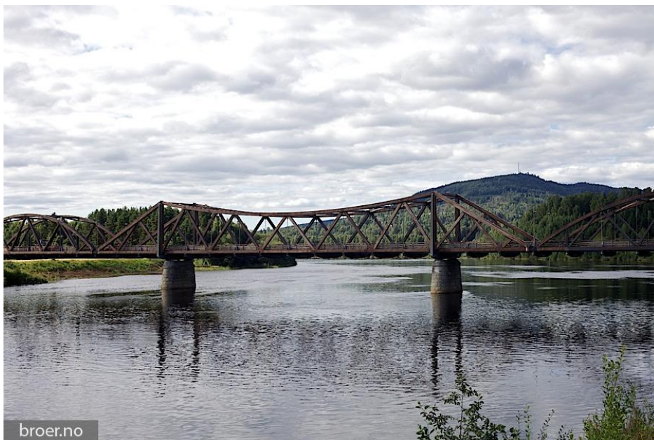
Figure 1: Flisa Bridge (Norway) - (Flisa Bridge, 2003)

The Flisa Bridge is a Norwegian road bridge, with a total length of 196 meters, making it one of the longest timber road bridges in the world, and a maximum span of 70 meters. The bridge features a hybrid arch-truss structure with diagonal elements: It comprises two support planes and diagonal braces that serve as lateral stability bracing, arranged in an eccentric configuration.