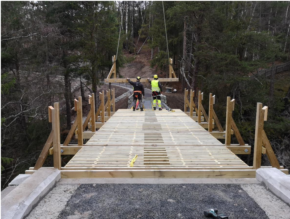
Figure 6: Gangbru Levert Til Fåvang (Norway) - (Gangbru levert til Fåvang, 2022)

The Fåvang Pedestrian Bridge is a single-span pedestrian bridge with a total length of 23 meters and a width of 3.2 meters. It is designed to support a total load of 10 tons, accounting for snow loads and service vehicles, ensuring long-term durability of the structure.