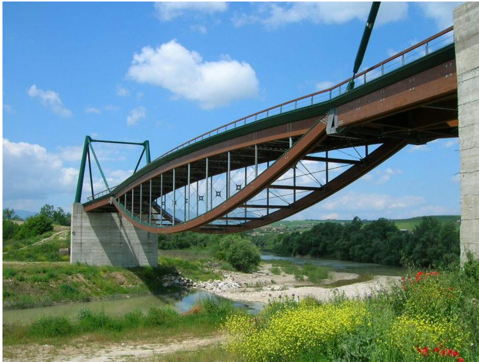
Figure 17: River Calore Bridge (Benevento) - (Ponte ciclabile sul fiume Calore - Benevento, 2005)

The River Calore Bridge in Benevento (IT) is a pedestrian and cycle bridge with a total length of 115 meters and a maximum clear span of 70 meters.