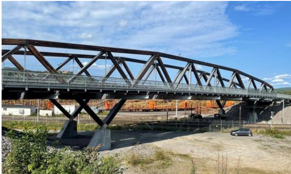
Figure 5: Norsenga Bridge (Norway) – (Norsenga Bridge, 2021)

The Norsenga Bridge has a total length of 94.5 meters, accommodating two traffic lanes, along with a dedicated pedestrian and cycling path.