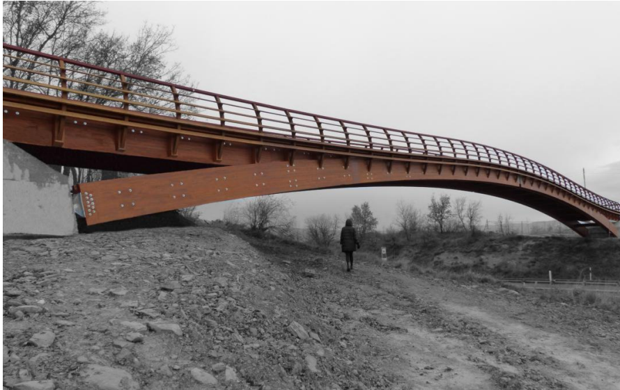
Figure 10: Anillo Verde Footbridge (Vittoria-Gasteiz) - (Puente de 61 m x 3 m Anillo Verde, en Vitoria-Gasteiz (4469), 2022)

The Anillo Verde Bridge has a total length of 61.08 meters and an effective width of 3 meters. This single-span structure crosses over the N-102 highway, connecting the Zabalgana neighborhood with the Armentia natural forest, thereby integrating into the city's 31-kilometer Green Belt.