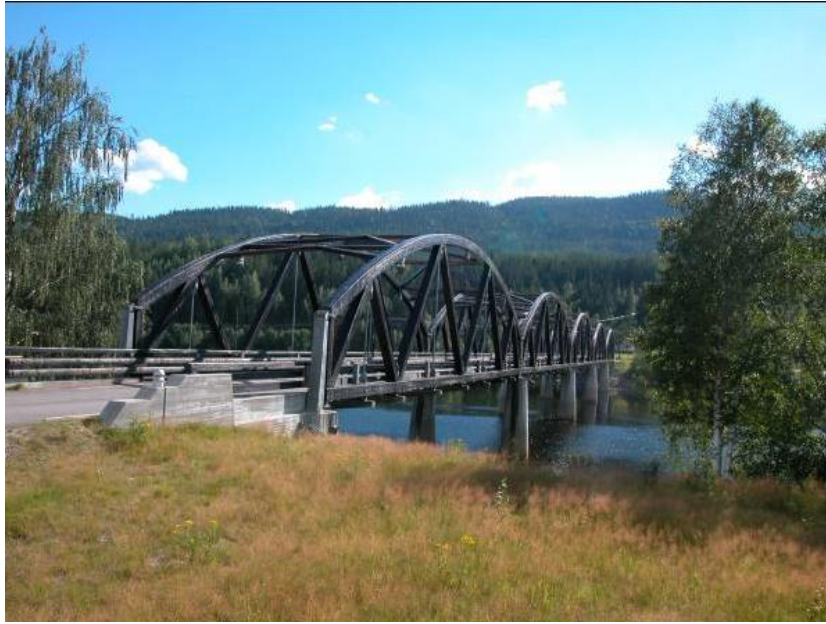
Figure 3: Evenstad Bridge (Norway) - (Evenstad bridge, 1996)

The Evenstad Bridge is a multi-span bridge with a total length of 180 meters, divided into five spans of 36 meters each. It consists of a sequence of identical repeating arch structures, which are supported by a triangular truss configuration.