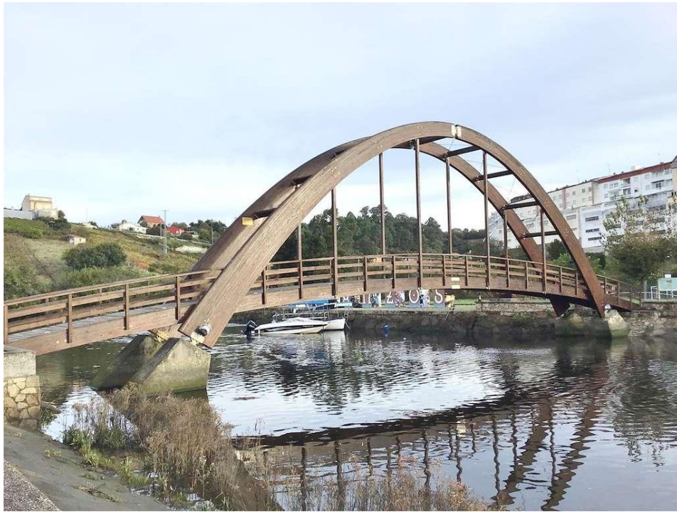
Figure 8: Betanzos Wooden Footbridge (Galicia) - (Betanzos - El nuevo puente de madera sobre el río Mandeo se instalará el próximo jueves, 2011)

The Betanzos Wooden Footbridge is a pedestrian bridge originally constructed in 1992 and later replaced with a new structure in 2011. The bridge features a single-span design with a total length of 40 meters and a width of 2.5 meters.