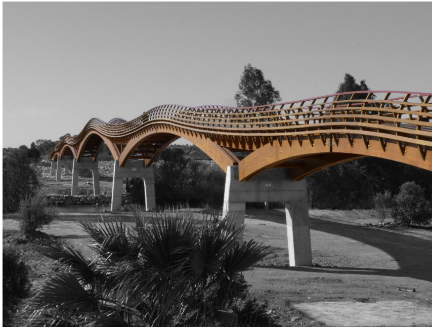
Figure 15: Guadalhorce Bridge (Malaga) - (Puente de madera con 273 m sobre el río Guadalhorce, Málaga (5082), 2022)

The Guadalhorce River Footbridge in Málaga is a pedestrian bridge with a total length of 273 meters and a useful width of 3 meters. The bridge is composed of seven spans arranged in a symmetrical configuration with increasing lengths. The central span, which crosses the main branch of the Guadalhorce River, measures 69.66 meters, making it the longest span. The adjacent spans are 55 meters, followed by spans of 31 meters and 15 meters, respectively.