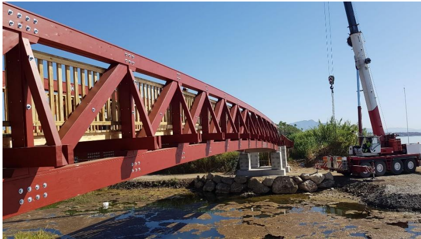
Figure 9: Castor River Footbridge (Estepona) - (El Puente sobre el río Castor parte desde nuestras instalaciones, 2023)

The Castor Footbridge is a pedestrian bridge that is part of the Senda Litoral Plan, a program aimed at integrating the territorial and environmental diversity of the province into a single route, creating a meeting point between various cultural and environmental aspects.