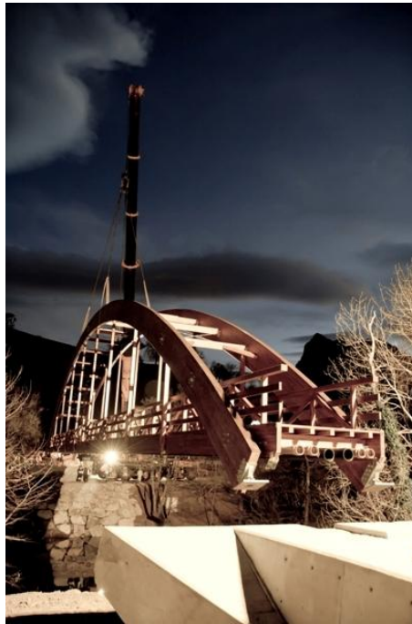
Figure 7: Cubillas Foot Bridge (Cantabria) - ( El puente de madera más largo sobre los ríos de Cantabria. , 2023)

The Cubillas Footbridge is a timber pedestrian bridge with a total length of 46 meters, featuring a single-span structure and a width of 2.5 meters.