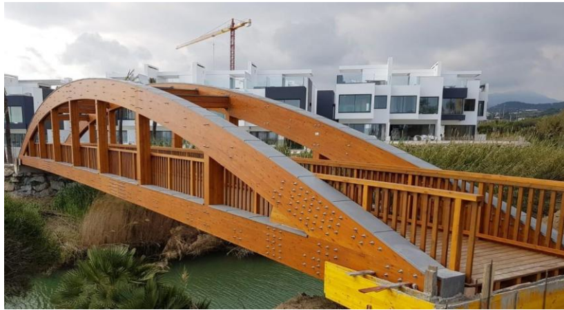
Figure 13: Arroyo Guadalobón (Estepona) - (Puente 42x3 - Arroyo Guadalobón (Estepona), 2023)

The Arroyo Guadalobón Bridge is a pedestrian timber bridge featuring a double-plane structural arch with a single-span configuration. The bridge has a total length of 42 meters and a width of 3 meters.