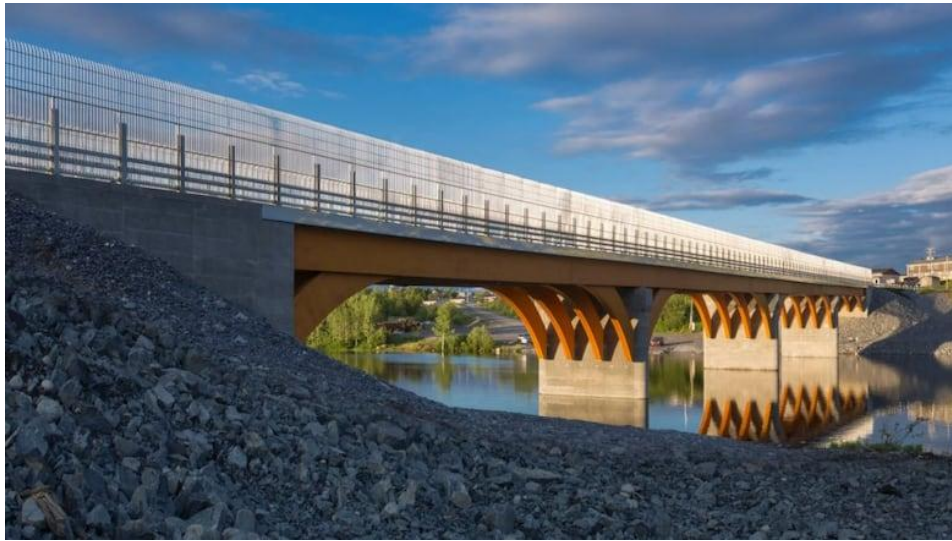
Figure 4: Mistissini Bridge (Québec, Canada) – (Mistissini Bridge, 2014)

The Mistissini Bridge has a total length of 160 meters, consisting of four spans measuring 37, 43, 43, and 37 meters, respectively. It has a width of 9.25 meters, accommodating two bidirectional traffic lanes.