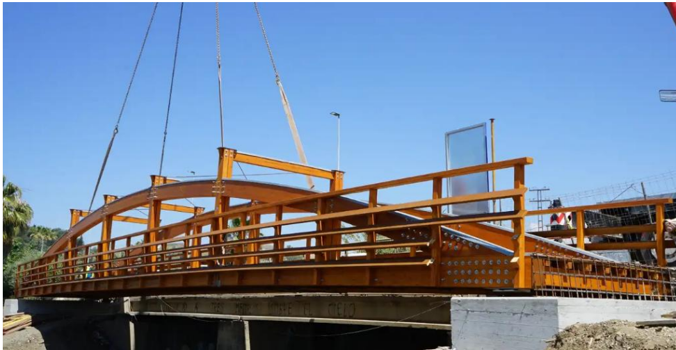
Figure 14: Arroyo Gui Footbridge (Torrox) - (Una nueva actuación de la Senda Litoral une Torrox con Vélez-Málaga, 2021)

The Arroyo Gui Bridge is a timber pedestrian bridge with a single-span configuration of 30 meters. It is designed as a segmented arch bridge, where individual segments are connected by vertical elements, which function as vertical stabilizers. Despite its arched shape, structural behavior is more akin to a truss bridge due to the segmentation and load distribution.