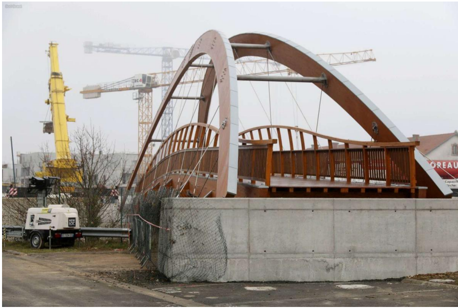
Figure 11: Passerelle Mangin (La Rochelle) - (La Rochelle : et voici la fameuse passerelle Mangin, 2021)

The Passerelle Mangin is a pedestrian bridge measuring 40 meters of length and 3 meters of width, structurally composed of two arch support planes, which are slightly inclined towards the static centroid of the structure and interconnected by horizontal elements, also made of timber, to enhance overall stability.