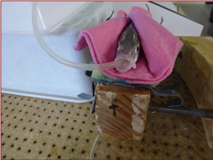
Figure 4. Pre-surgery setup in which samples were anesthetized by irrigating gills with anaesthetic