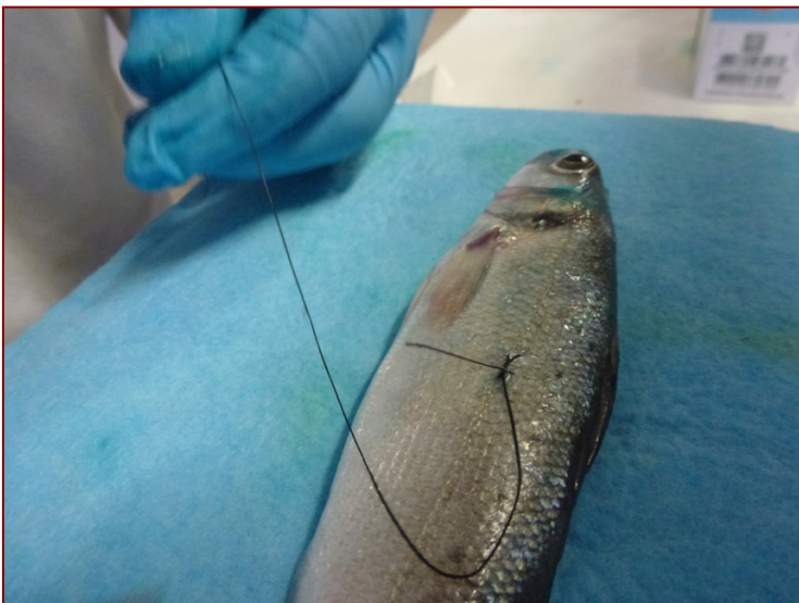
Figure 5. Once melatonin implants were inserted stitches were applied