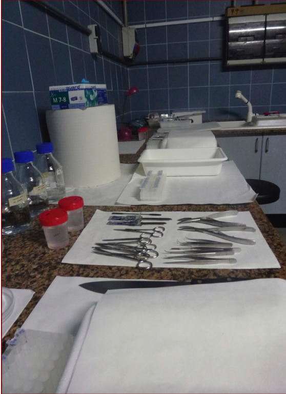
Figure 7. Sampling station